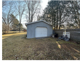
Garage in back