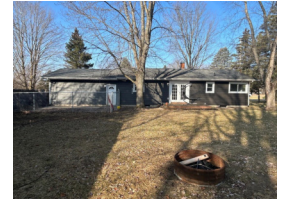
Back of home