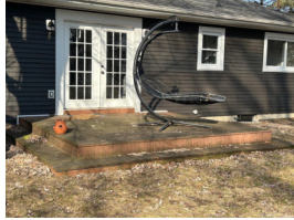
Deck off dining room