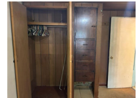
Closet main bedroom