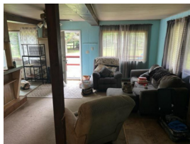
View of living room