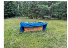
Well and Well cover