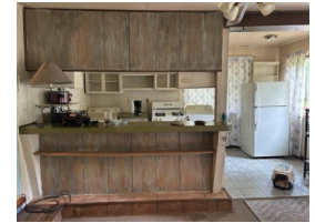
Bar area off kitchen